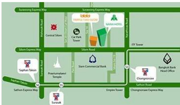
Map to The Narai Hotel