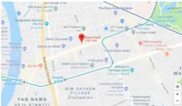
Map of the Silom area